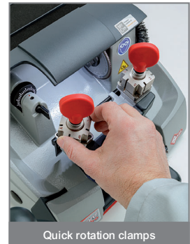
Quick rotation clamps