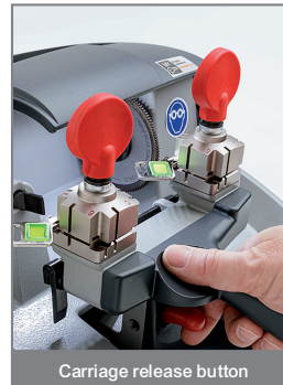
Carriage release button

The clamps can be quickly and smoothly turned without first needing to be removed thanks to the unique, patented rotation system. The clamps are tightened with ergonomic handles with a ball bearing system to fix the key perfectly without damaging the clamp. The clamps made from sintered metal with a protective nickel coating for strength and durability.