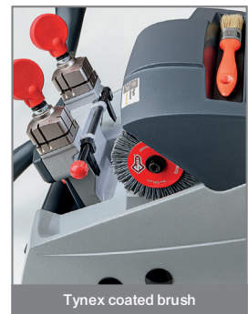
Tynex coated brush

The de-burring brush is Tynex coated to ensure uniform abrasion and a perfectly finished key.