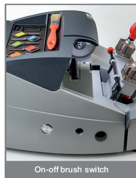
On-off brush switch

Rekord Pro S is equipped with a mechanical tracer point with an easy to read micrometric adjustment ring for accurate calibration and a quality cutting result.