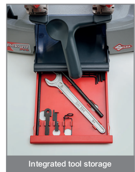
Integrated tool storage

Rekord Pro S has a LED strip light over the cutter to clearly illuminate the working area.