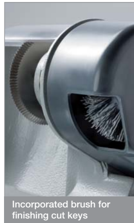
Incorporated brush for finishing cut keys