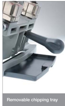
Removable chipping tray