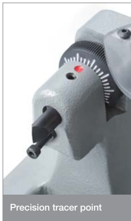
Precision tracer point